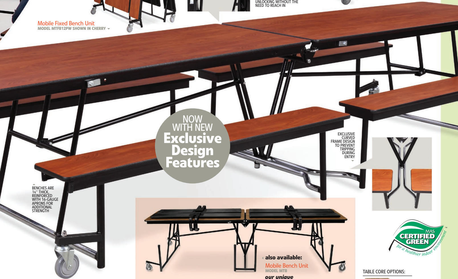
Mobile Fixed Bench Unit MODEL MTFB12PW SHOWN IN CHERRY

NEWLY REDESIGNED STORAGE LATCH INCLUDES RELEASE LEVERS ON EITHER SIDE TO ENABLE UNLOCKING WITHOUT THE NEED TO REACH IN