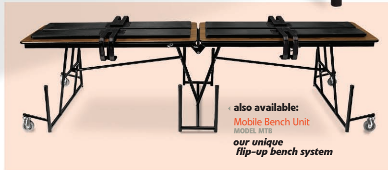
also available: Mobile Bench Unit MODEL MTB our unique flip-up bench system

BENCHES ARE 3/4" THICK, REINFORCED WITH 16-GAUGE APRONS FOR ADDITIONAL STRENGTH