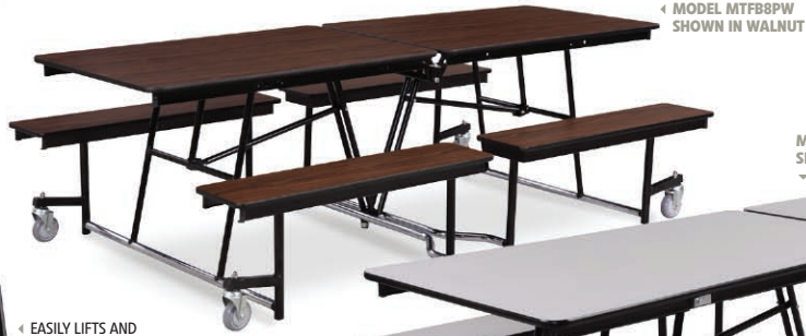
MODEL MTFB8PW SHOWN IN WALNUT