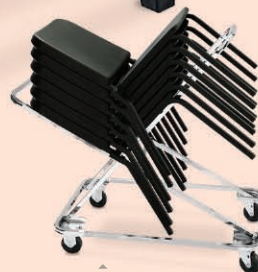
DY82 Series HOLDS UP TO 18 MELODY CHAIRS