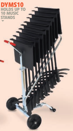
DYMS10 HOLDS UP TO 10 MUSIC STANDS