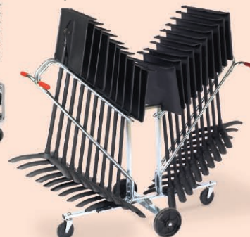
DYMS20 HOLDS UP TO 20 MUSIC STANDS